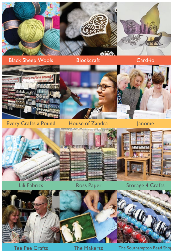
Black Sheep Wools